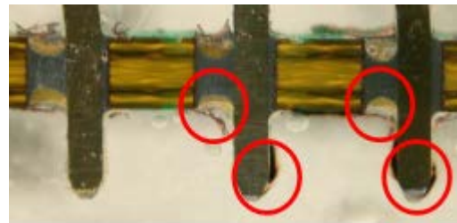
Solder starvation in PIP processed solder joint. Also note the excess residual flux.